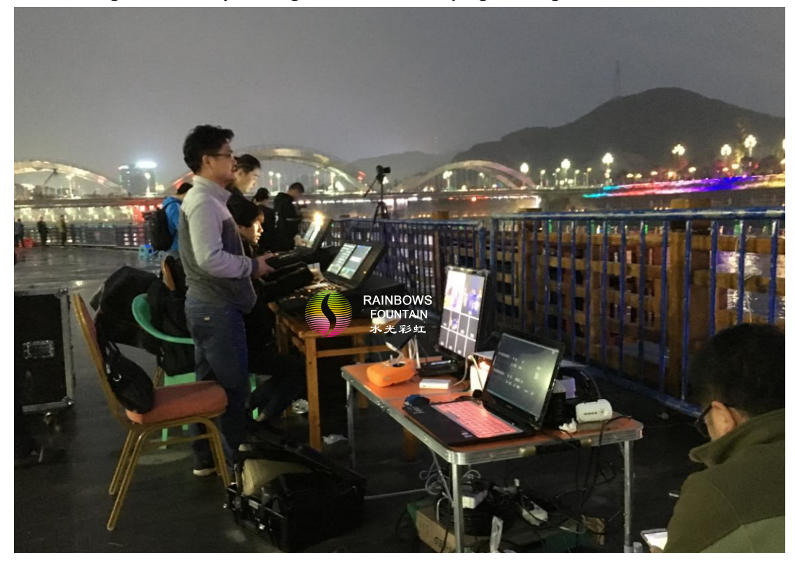
Bridge digital water curtain installation on site